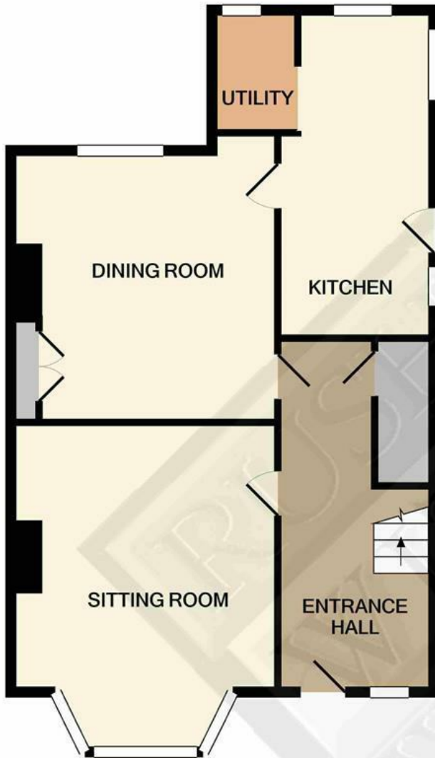
GROUND FLOOR APPROX. FLOOR AREA 521 SQ.FT. (48.4 SQ.M.)