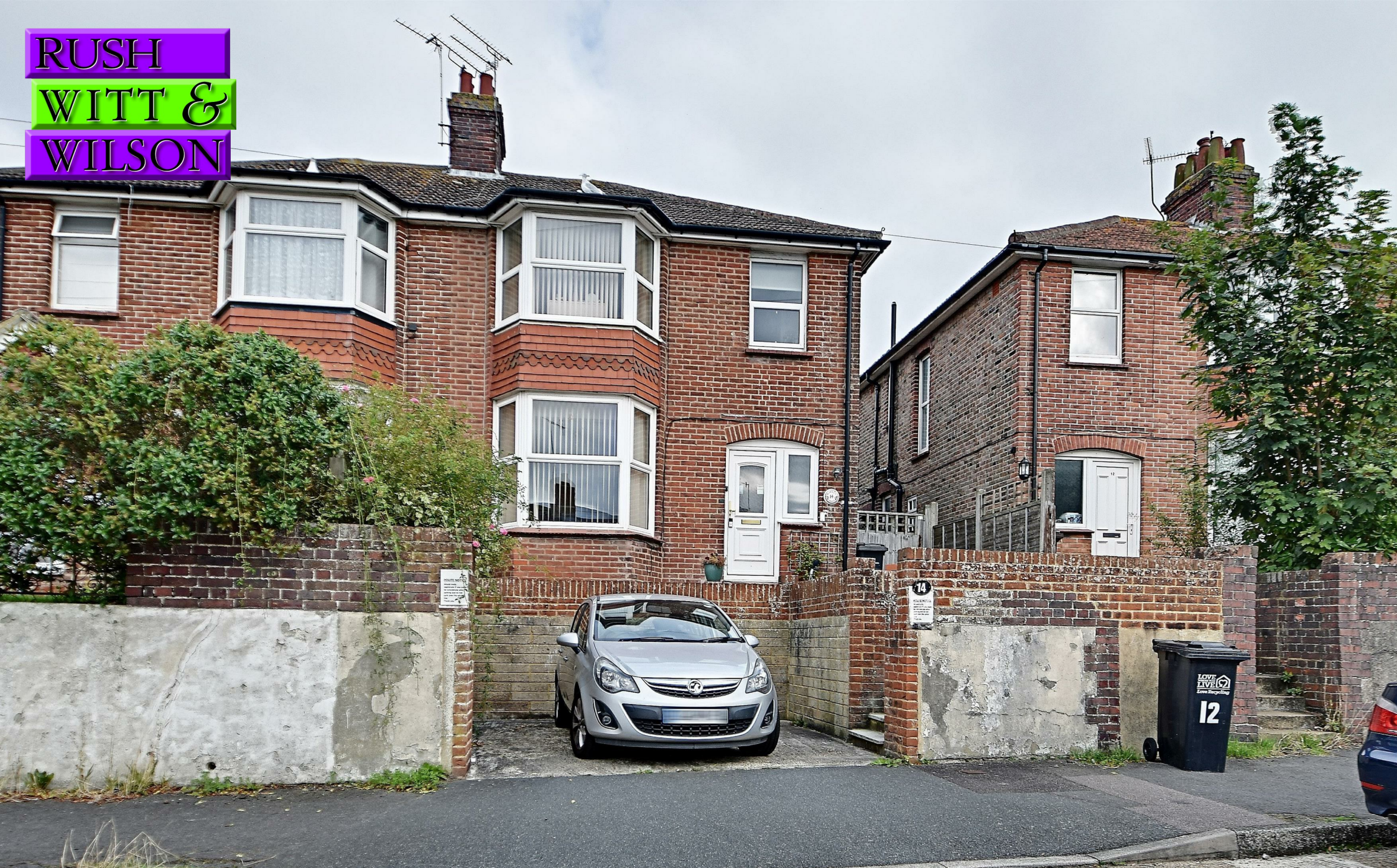
14 Maberley Road, Bexhill-On-Sea, East Sussex TN40 2DB £299,000